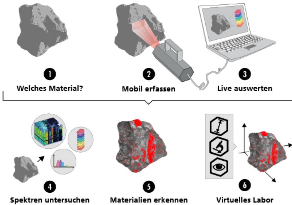
3: Operating procedure of the SpectralFinder